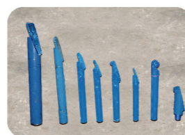
Beacon housing and drill bit