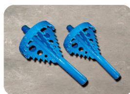
Fly Wing Backreamer