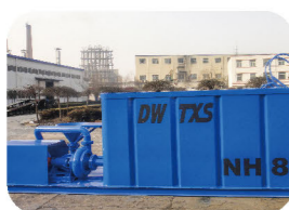
Mud mixing unit